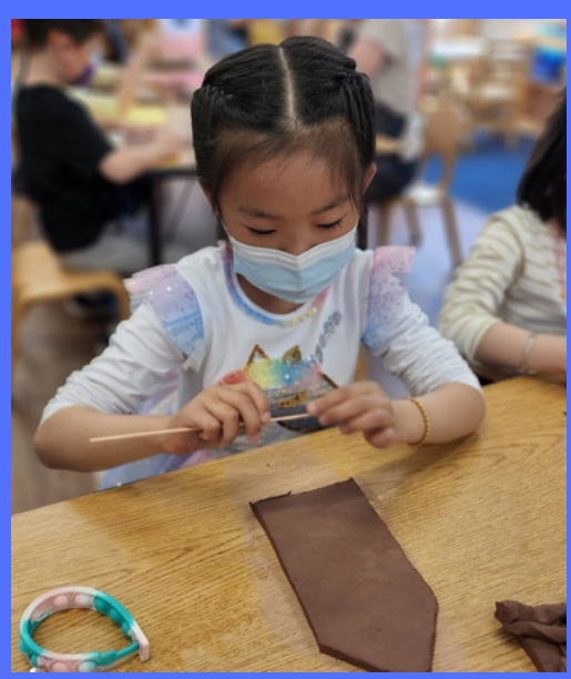
The Rising Kindergartners Program is part of our longstanding School-Age Program, which provides out-of-school time academic enrichment to K-7th graders (through 12 years of age). Details on page 3!